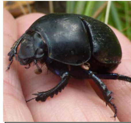
Humble but essential. The unappreciated dung beetle

Finally, we need to think about whether we can live together with our beetles – and see them as part of a healthy balanced garden. Can we put up with a few nibbled leaves and learn to love our beetles? It's easy to love the ladybirds, the glow worms and to be impressed by the stag beetles that we have here in Essex and even the dung beetle. But I have to confess I'm still struggling with the lily beetle – which is not a native here in the UK.